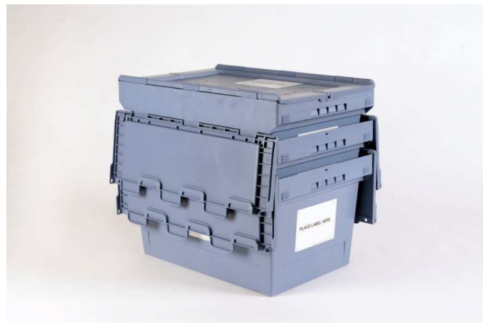
Placard allows for nesting of conical containers