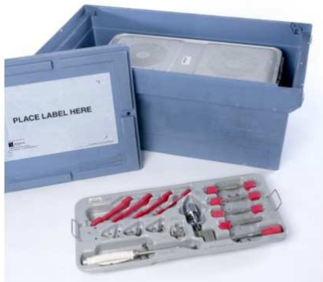
Application on flight cases for medical instruments